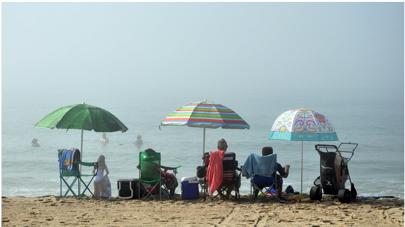
Beachgoers in Westerly, R.I. ALEX NUNES - THE PUBLIC'S RADIO

The shoreline access bill aims to clarify where people can do things like walk, fish and collect seaweed on rocky or sandy shoreline, with the hope of preventing disputes between beachgoers and private property owners along the coast. But despite passing in the House in a 64-0 vote, the future of the legislation is unclear.